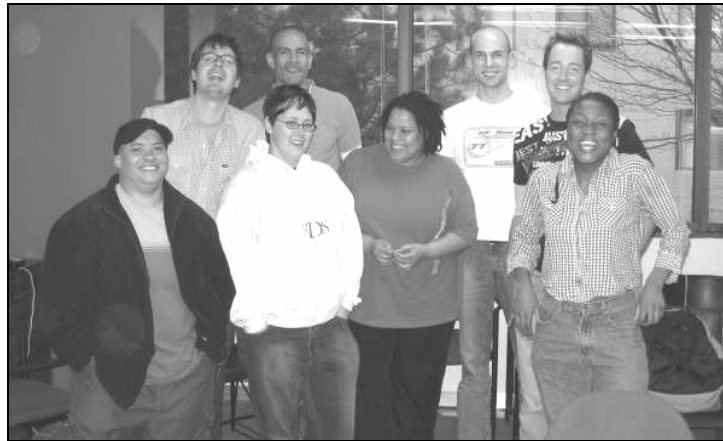
Team Youth Line: Volunteers make it happen everyday in every way

We hope you will join us this year in supporting the Youth Line. Our volunteers and staff are working very hard to promote and provide a much-needed service by letting young folks know that they are not alone.