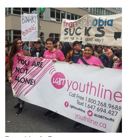
Trans March, Toronto