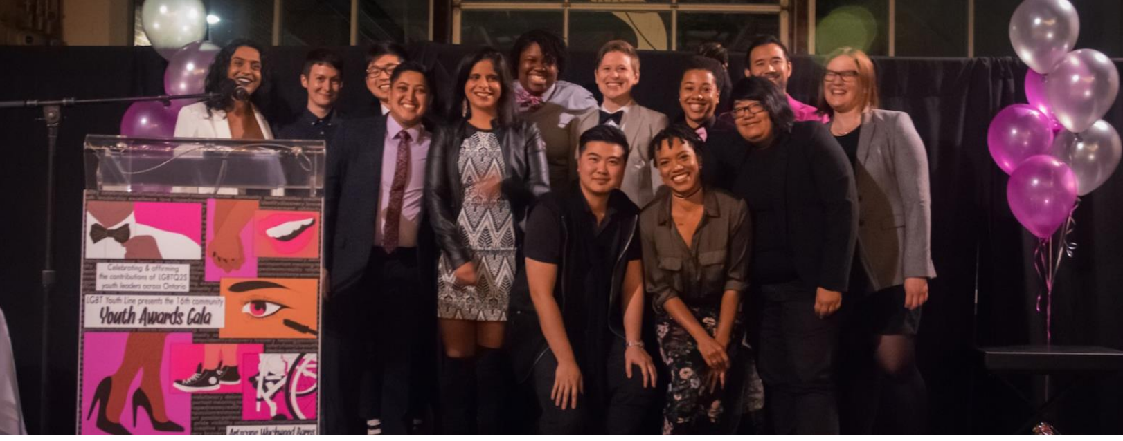
LGBT Youth Line staff and board at the Youth Awards Gala