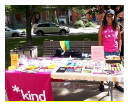
Capital Pride, Ottawa