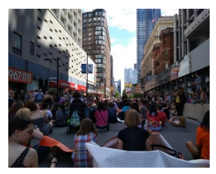
Dyke March, Toronto